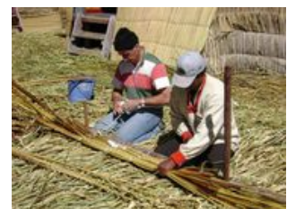
Included Meals: Breakfast, Lunch

Today we wake up early to check the nets we cast the night before. With any luck, we can enjoy fresh fish for a healthy breakfast. Following breakfast we meet the local children and have the opportunity to interact with them during their recess. After lunch we must say goodbye and set sail for Puno. From here, we pick up a local bus to the city of Desaguadero at the border of Bolivia, and then another bus the 86 kilometers to La Paz , where we'll spend the night. On the way, we can enjoy the Cordillera Real mountain range, with its soaring 20,000-foot peaks - including the famous Huayna Potosí.