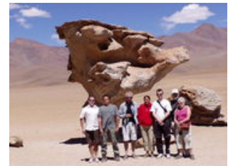
Included Meals: Breakfast, Lunch, Dinner

Prepare for day of spectacular scenery. We are headed straight to the highland lakes of cañapa and charcota. Boarding our 4x4's we head down from the highlands to Laguna Colorada (4275m) Did you know that there are three different types of flamingos that live here? The Salar is the breeding ground for these long legged beauties which congregate in November. Our next stop is at Rock Tree , a group of rocks forming the shape of a tree, characterized by their bizarre shapes that have been sculptured by the sandy desert winds over centuries. Tonight our rural location requires that we stay in a rustic hostel with dormitory style lodging. Nights can get quite cold, blankets are provided but be sure to bring something warm to wear as well.