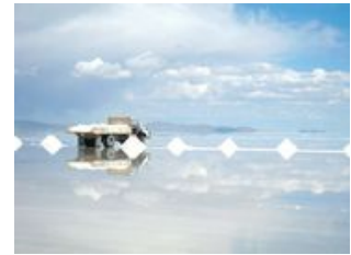
Included Meals: Breakfast, Lunch, Dinner