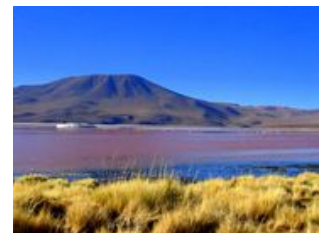
Included Meals: Breakfast

We depart our hostel at 5 am to visit the geysers of the morning sun , arriving early the billowing water vapor condenses rapidly in the frigid air making for a truly incredible experience. Walk among the gurgling mud pools, and hear them hissing as you pass as if warning you of their presence. Warm up in the aguas termales (natural hot springs) and rejuvenate before we continue. After a relaxing soak, get ready for a real treat, Laguna Verde (the green lagoon) the breeding grounds for three different types of flamingos and a great photography spot. Our final stop of the day is Laguna Blanca named so for the milky white water. Tonight you can leisurely walk around the small town of only 5,000 residents and view the surrounding town as it overlooks the Licancabur volcano.