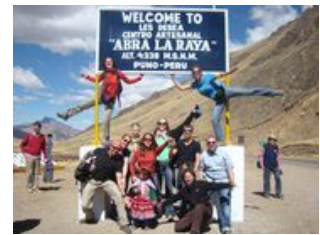
Included Meals: Breakfast, Lunch

In the afternoon we visit La Raya on the border between Cuzco and Puno. With an elevation of more than 14,000 ft we see the expansive Andes mountains in their full magnitude, a great place for a photo opportunity. Our third stop is Pucara , where we visit the ruins of the Pucara culture and the museum. We arrive to Puno in the evening. Did you know it's the capital of folklore? In the evening we will take a leisurely stroll along Jr Lima Street to find the best restaurants, bars and discos.