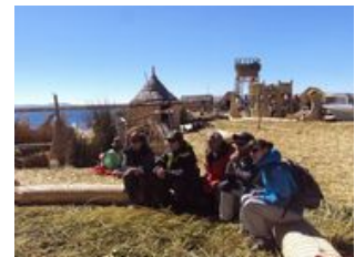
Included Meals: Breakfast, Lunch, Dinner

Our first stop is Capachica , where we'll visit one of the many social projects supported by viventura. Did you know that the money you paid for this tour is helping support this project? Approaching the peninsula, the festively dressed inhabitants with brightly colored garments and traditional top hats are waiting to greet us. Here, you'll have the chance to meet the locals, discover the work that's being done and enjoy a traditional lunch with the locals. You can even take a weaving class!